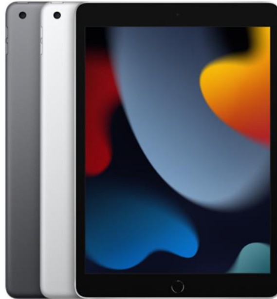
iPad(5 th – 9 th generation)